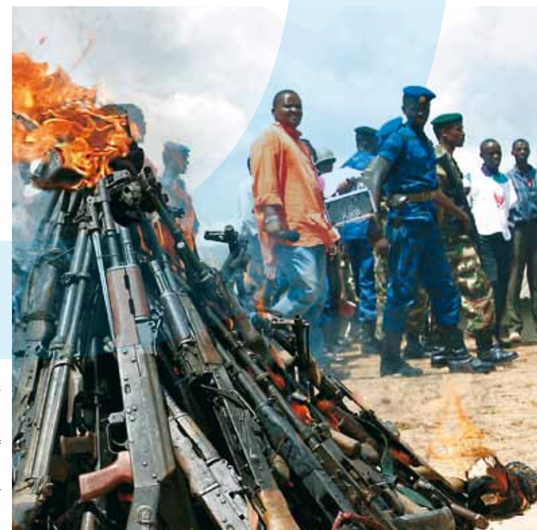
Burundi (02.12.2004).