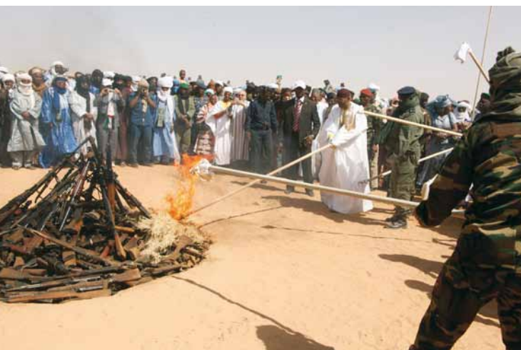
Mali (09.02.2011).