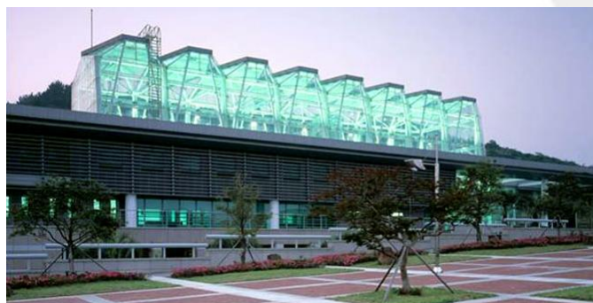
CIFAL Jeju Training Centre

Jeju, 11 Nov.: CIFAL Jeju, Republic of Korea, completed its first training on Green Growth. Participants from Pakistan, Philippines, Viet Nam, Nepal, Bangladesh, and Indonesia had the opportunity to visit Jeju's Smart Grid testing centres exploring future innovations for renewable energy while limiting carbon emissions.