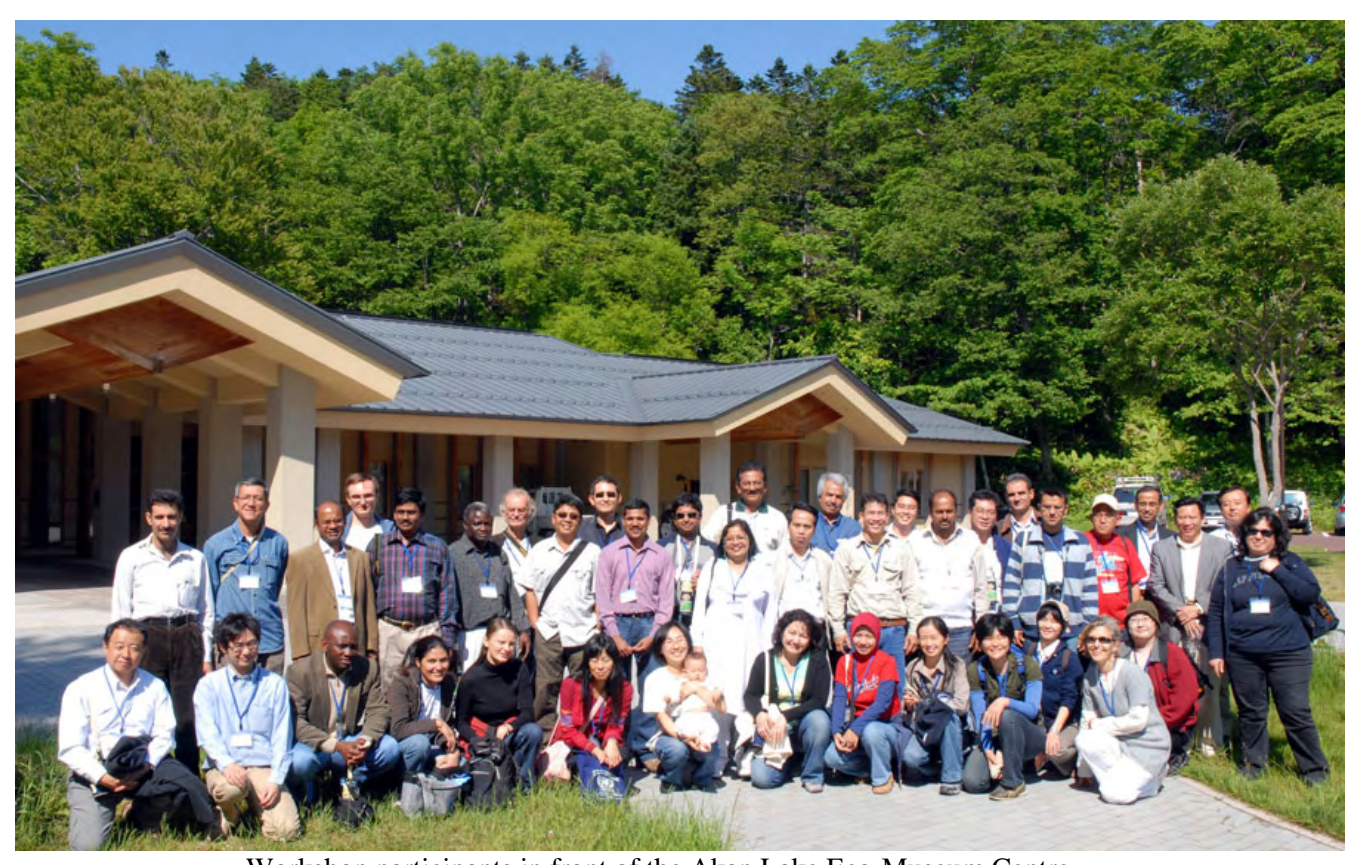
Workshop participants in front of the Akan Lake Eco-Museum Centre