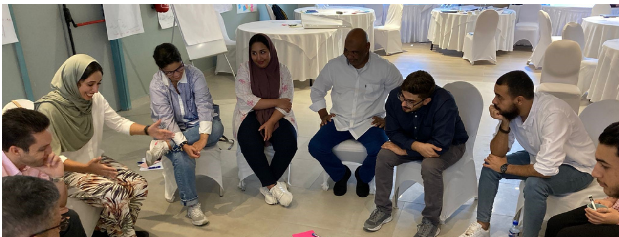
UNITAR, Tunis, October 2022

UNITAR's Training of Trainers model was created to support the build-up of institutional capacity for training in the areas of peacekeeping and peacebuilding. This approach is at the core of the Institute's philosophy and our focus on training and coaching. The approach is designed to allow for a progressive transfer of knowledge and skills to training institutions and its personnel, in the view of ensuring local ownership and long-term sustainability.