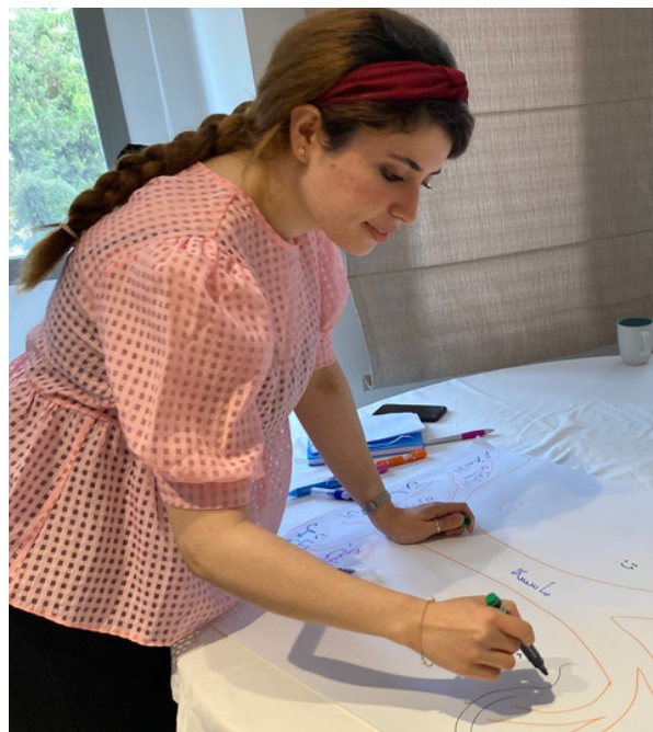
UNITAR, Tunis, October 2022

UNITAR's Training of Trainers model was created to support the build-up of institutional capacity for training in the areas of peacekeeping and peacebuilding. This approach is at the core of the Institute's philosophy and our focus on training and coaching. The approach is designed to allow for a progressive transfer of knowledge and skills to training institutions and its personnel, in the view of ensuring local ownership and long-term sustainability.