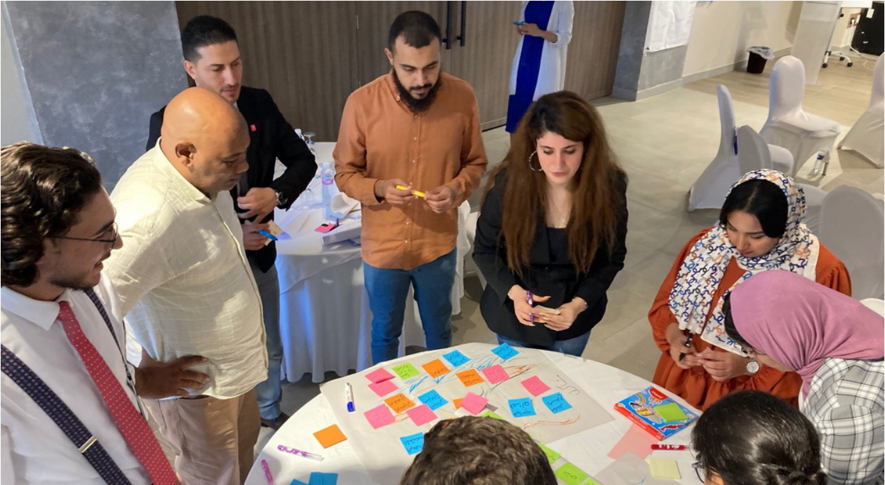
UNITAR, Tunis October 2022

In this Second Edition of our newsletter, you will find updates on the work we have achieved between August and November.