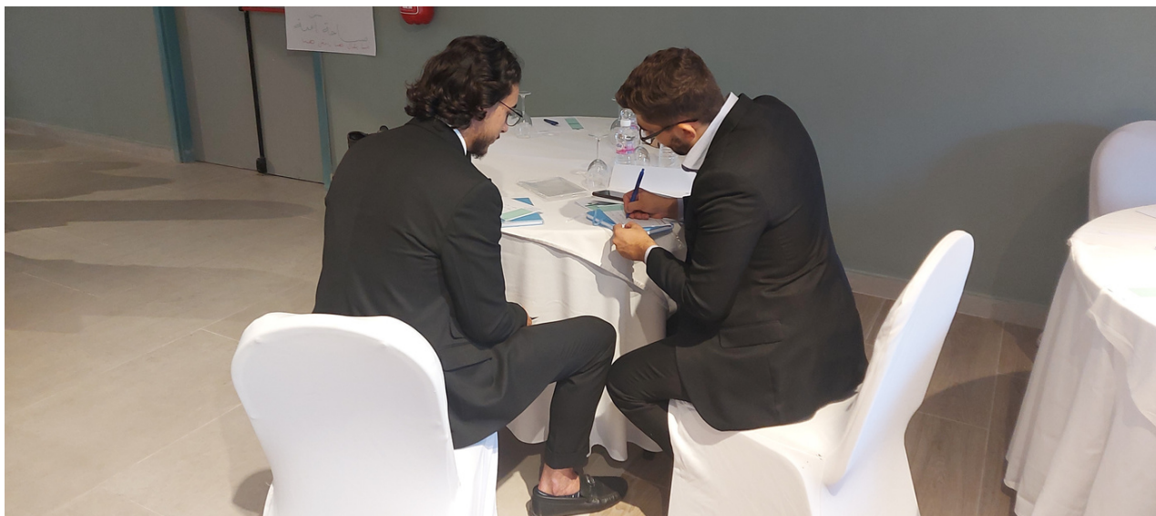
UNITAR, Tunis, October 2022

The first meeting focused on the administrative processes while it also guided the CSOs on how to create their own agendas of the multiplication trainings in terms of selecting the dates, time, duration, and what is the ideal recommended duration of each session and the flexibility of expanding the duration of these sessions as they deem appropriate.