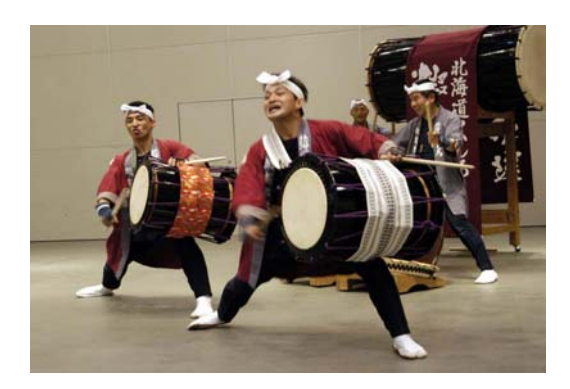
Taiko (Japanese drums) performance by Kushiro citizens

As a training institute of the United Nations, UNITAR gives primary importance to the development of training methodologies which will facilitate the acquisition of ready-to-use knowledge in a limited time (less than one week) among its participants, who are commonly mid to high level government officials. Various methodologies are thus applied, including After-Action-Review (AAR) and Peer Review, and are refined at each of its training sessions.