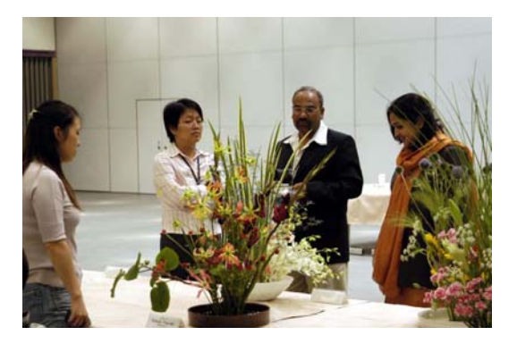
Ikebana (flower arrangement) demonstration