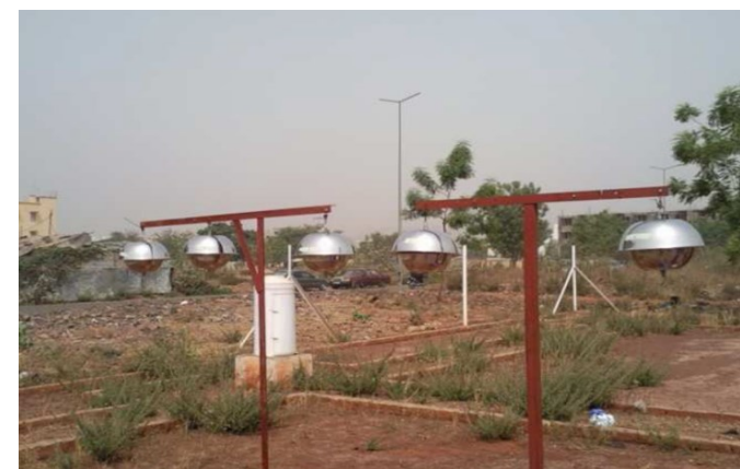
Example of passive air sampler site (Mali)

UNEP/GEF Four regional projects 2015-2018