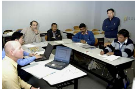
Yangtze River Basin Team