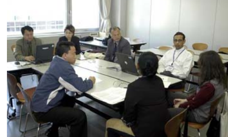
Lower Colorado River Basin Team