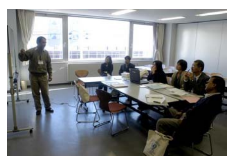
Indus River Basin Team